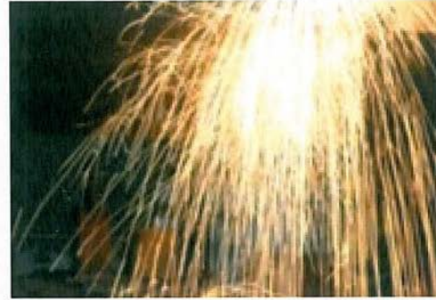
Quality welding by certified welders