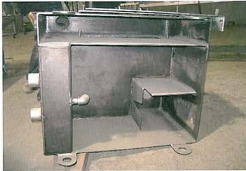
Flow Proportioning Equipment