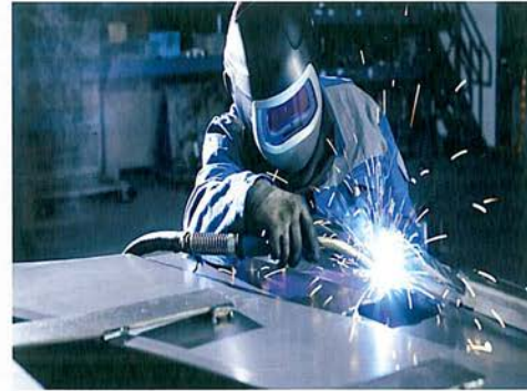
MIG, TIG, SAW Weding