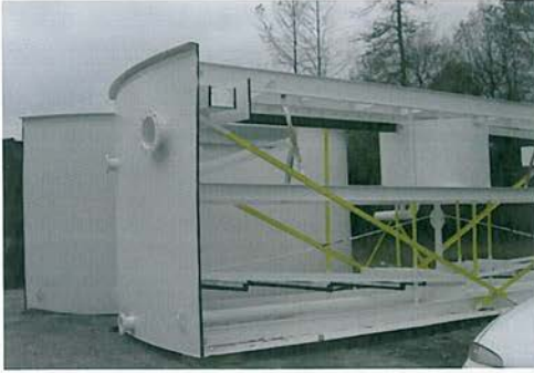
Mechanical Clarifier Fabrication