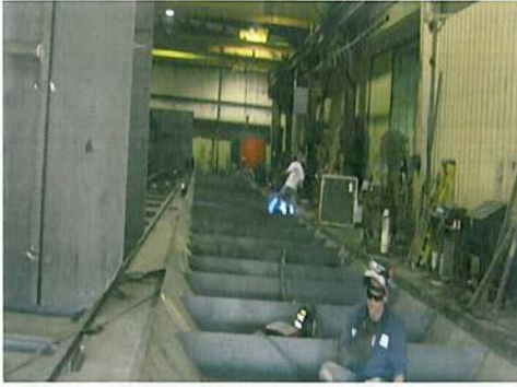
Typical Tank Stiffening