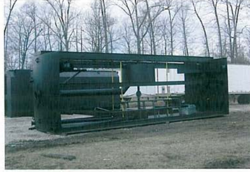
Typical Sludge Thickener Design