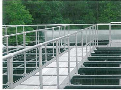
Aluminum Handrails and Grating Available